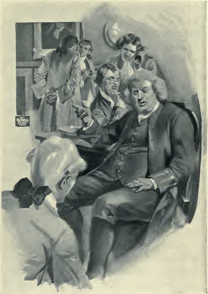
“WE SEE THE HEAVY FORM ROLLING, WE HEAR ITS PUFFING.”